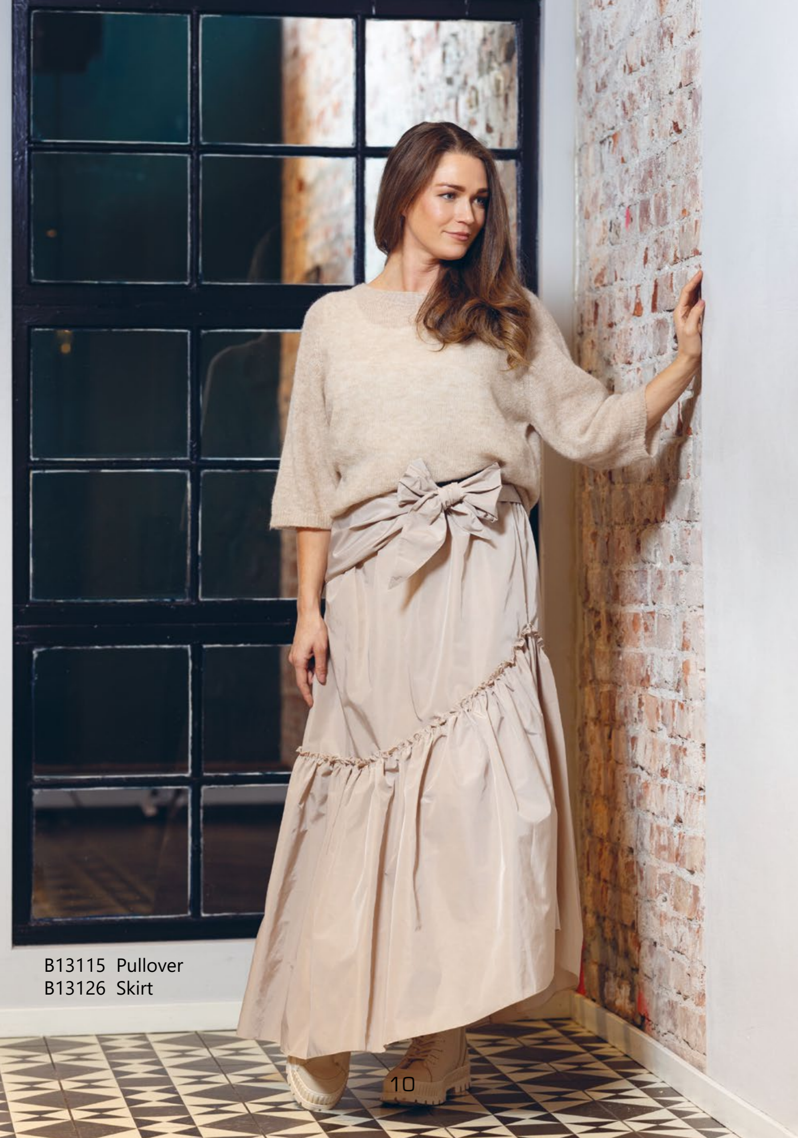
B13115 Pullover B13126 Skirt