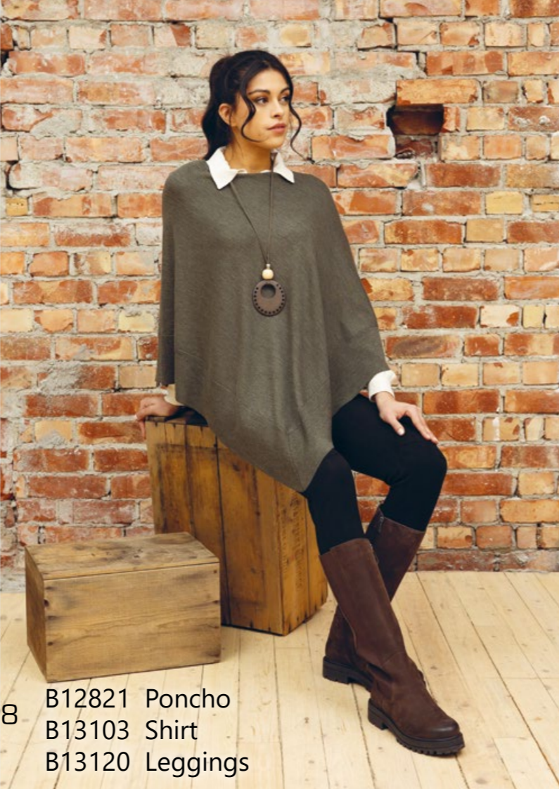
B12821 Poncho B13103 Shirt B13120 Leggings