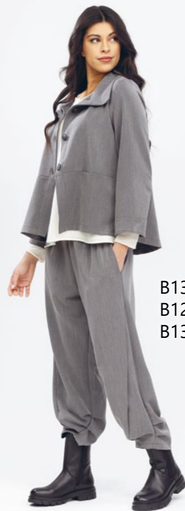
B13095 Jacket B12820 Pullover B13096 Pant