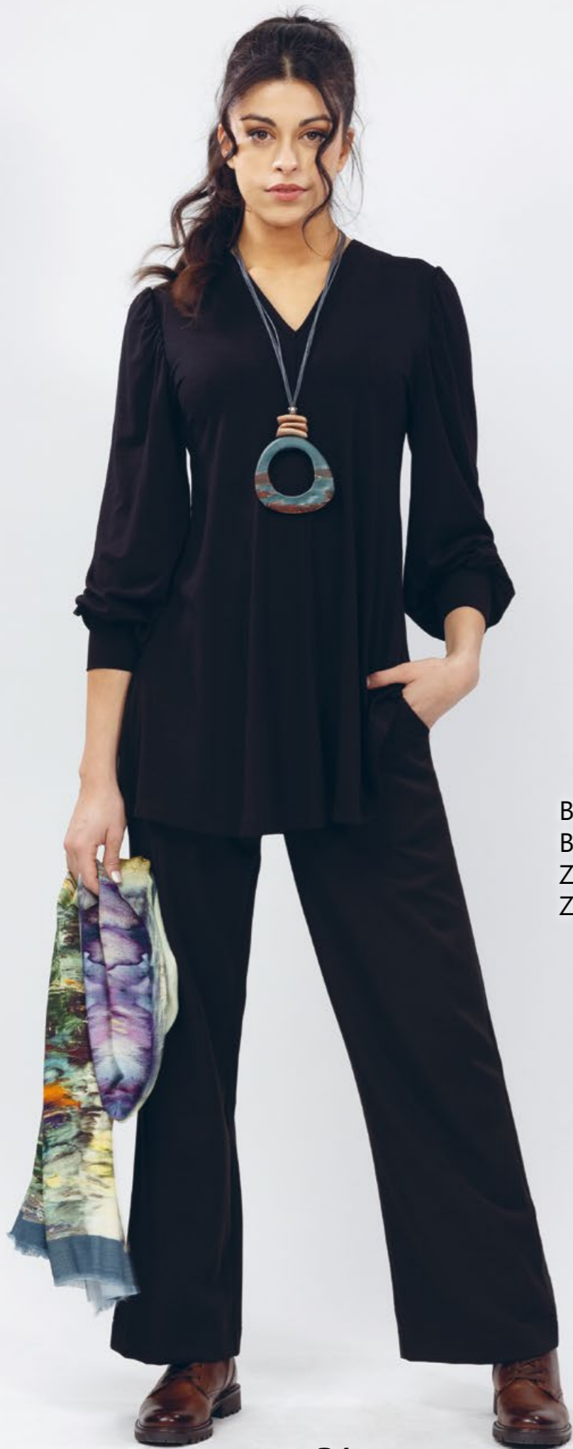
B13124 Tunic B13097 Pants Z10309 Necklace Z10325 Scarf