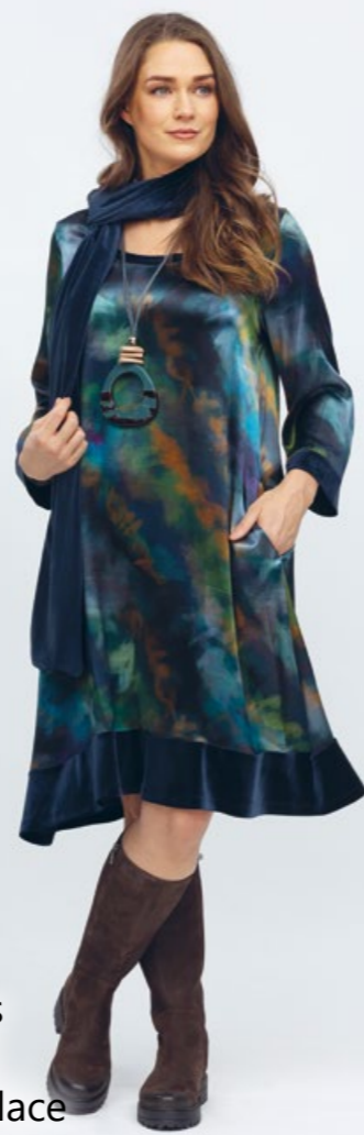
B13091 Dress B13094 Scarf Z10309 Necklace