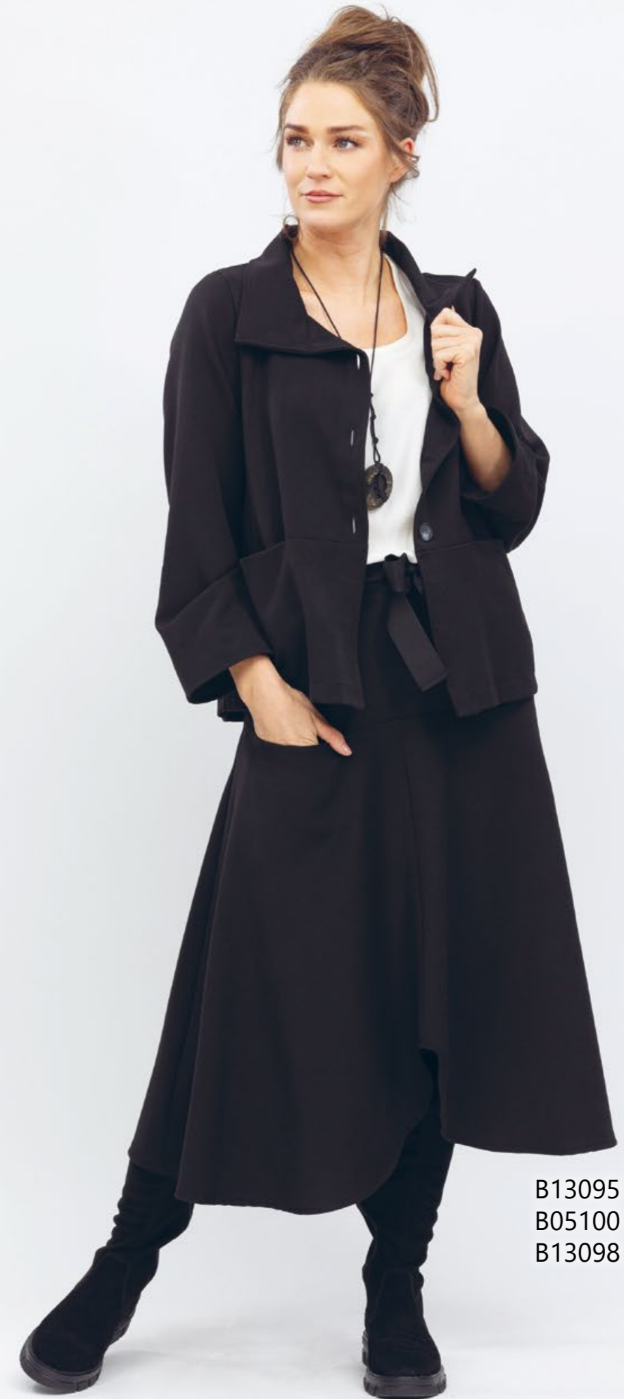
B13095 Jacket B05100 Singlet B13098 Skirt