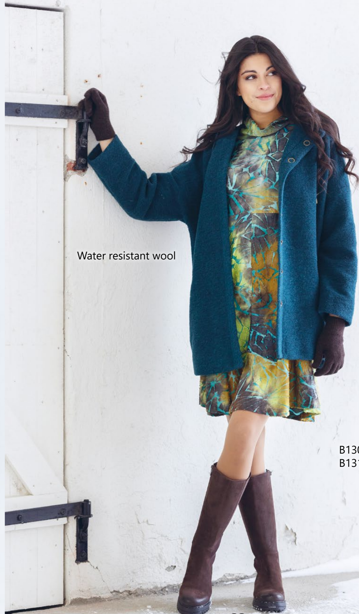
B13071 Jacket B13108 Dress