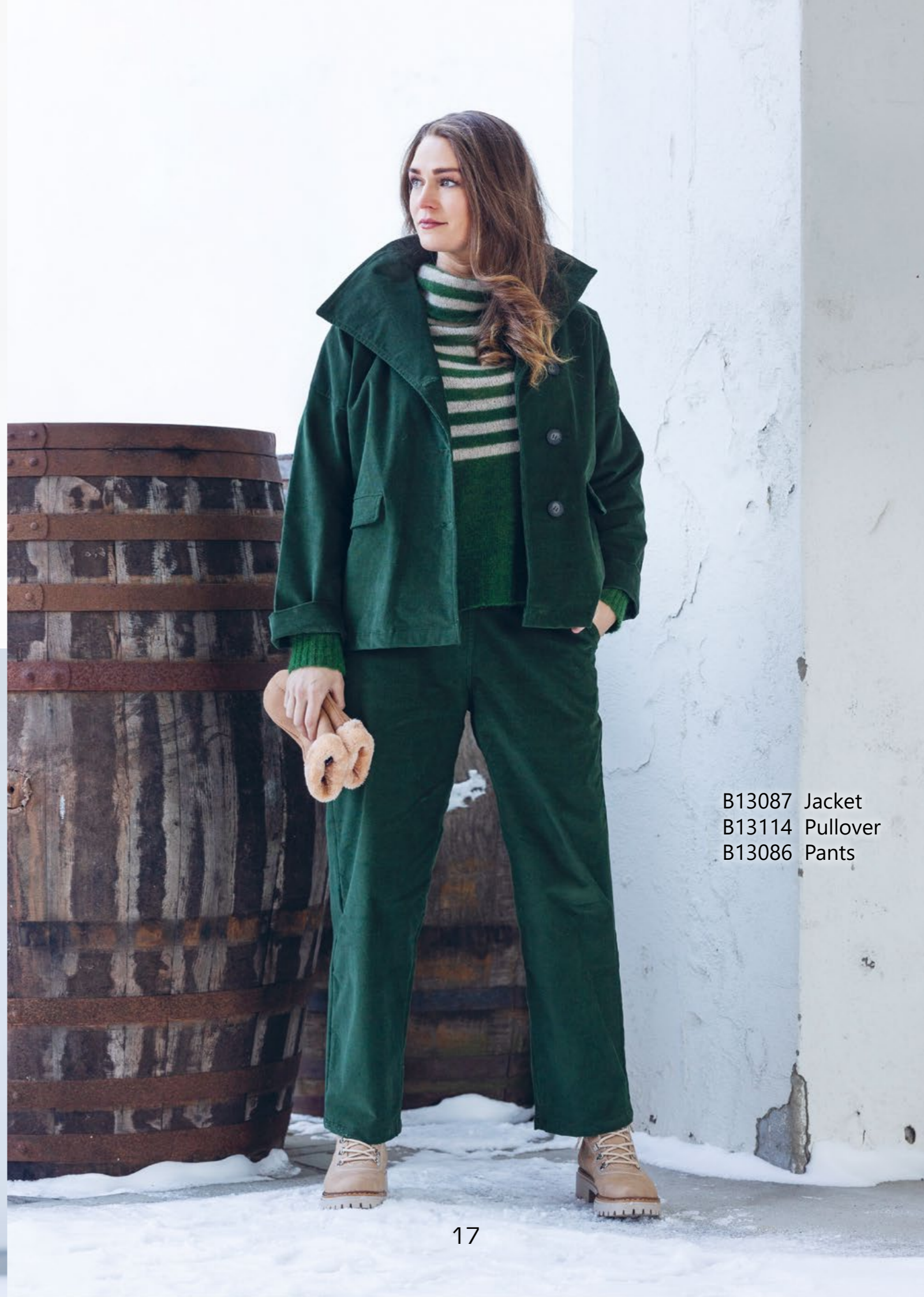
B13087 Jacket B13114 Pullover B13086 Pants