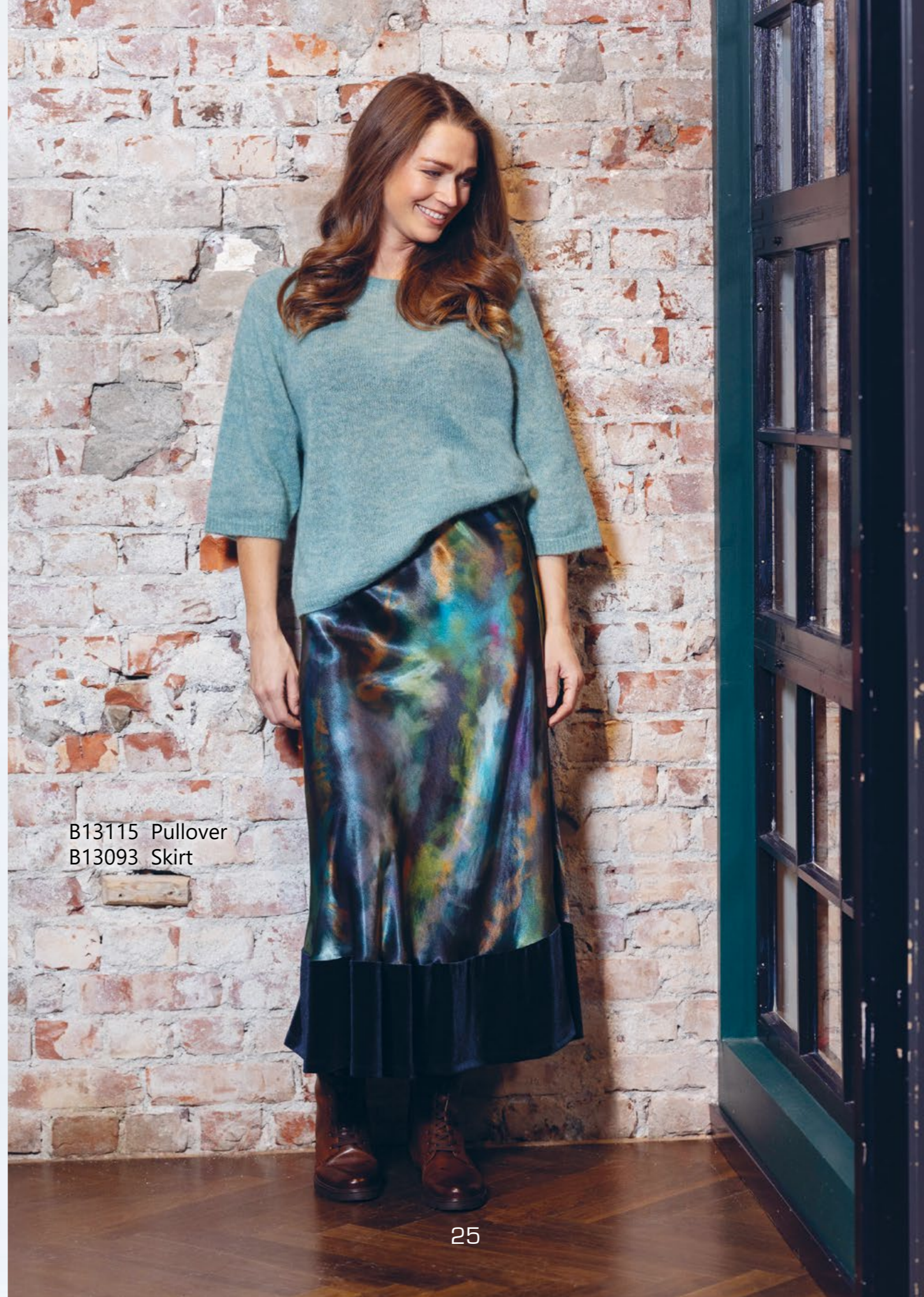
B13115 Pullover B13093 Skirt