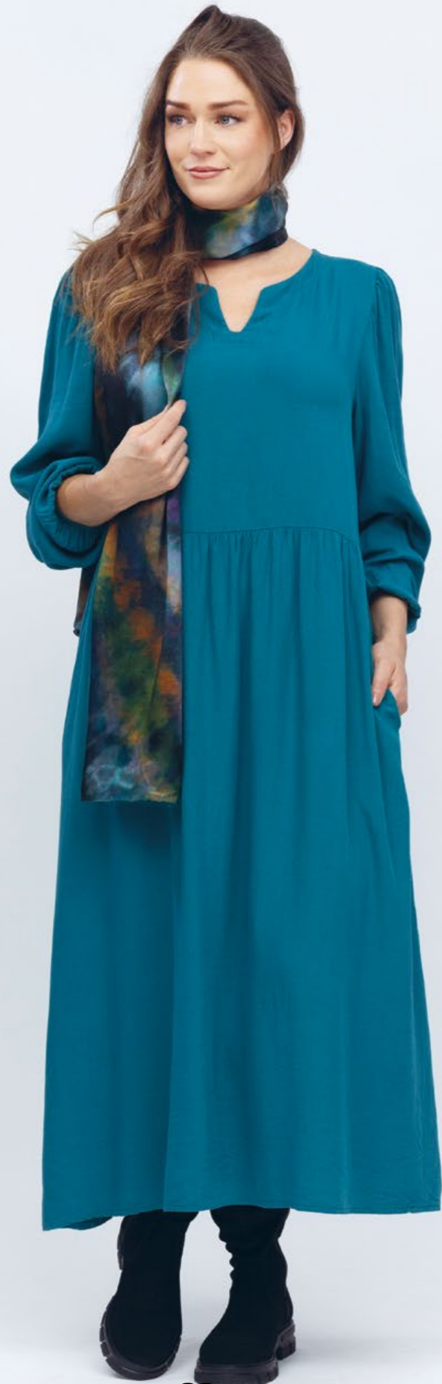
B13102 Dress B13094 Scarf