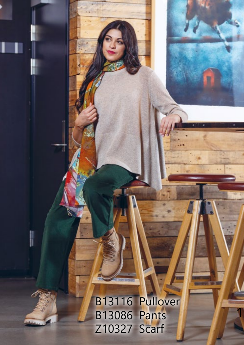
B13116 Pullover B13086 Pants Z10327 Scarf