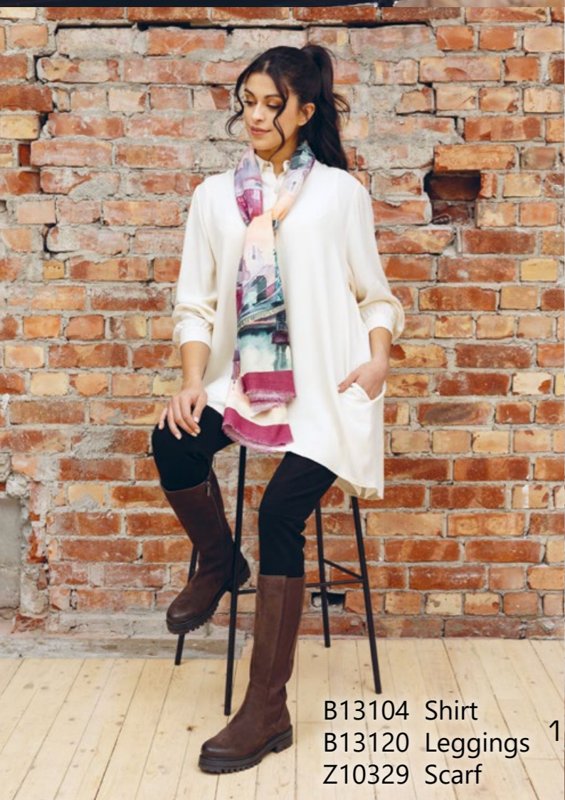
B13104 Shirt B13120 Leggings Z10329 Scarf