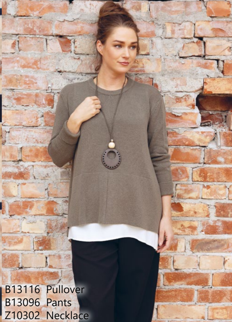
B13116 Pullover B13096 Pants Z10302 Necklace