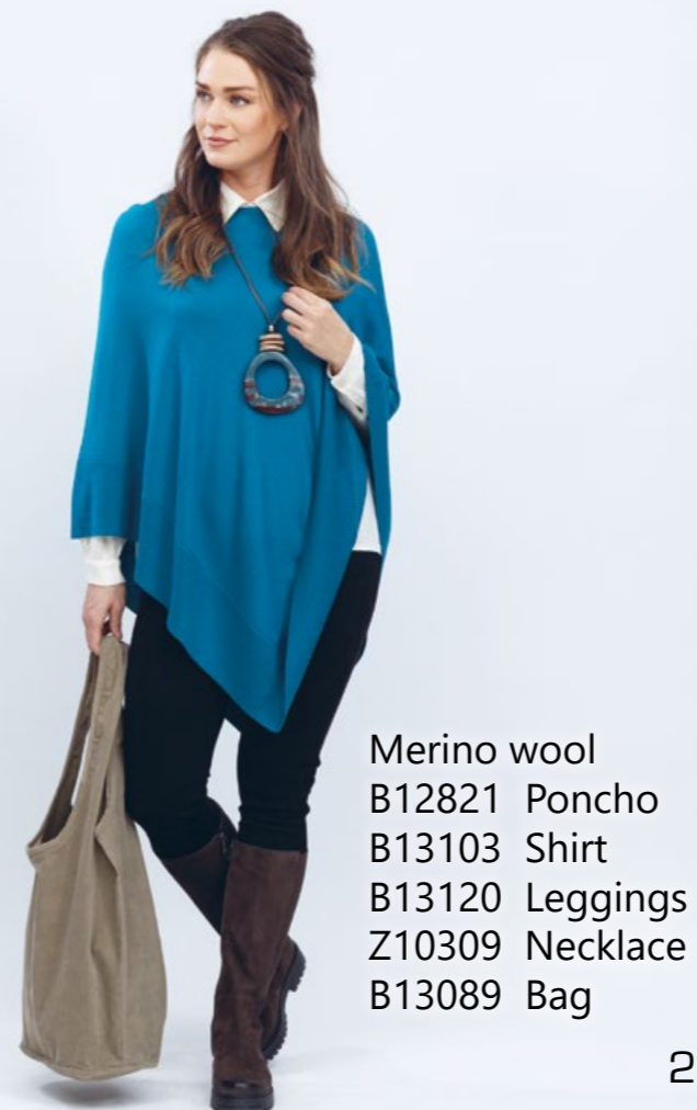
Merino wool B12821 Poncho B13103 Shirt B13120 Leggings Z10309 Necklace B13089 Bag