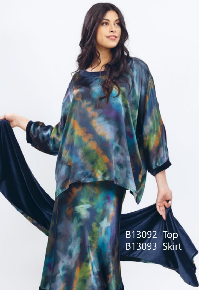
B13092 Top B13093 Skirt