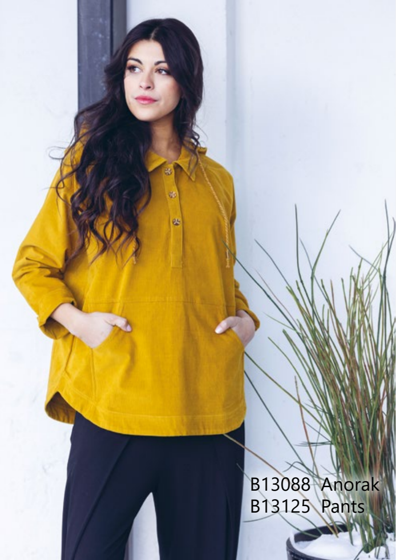
B13088 Anorak B13125 Pants