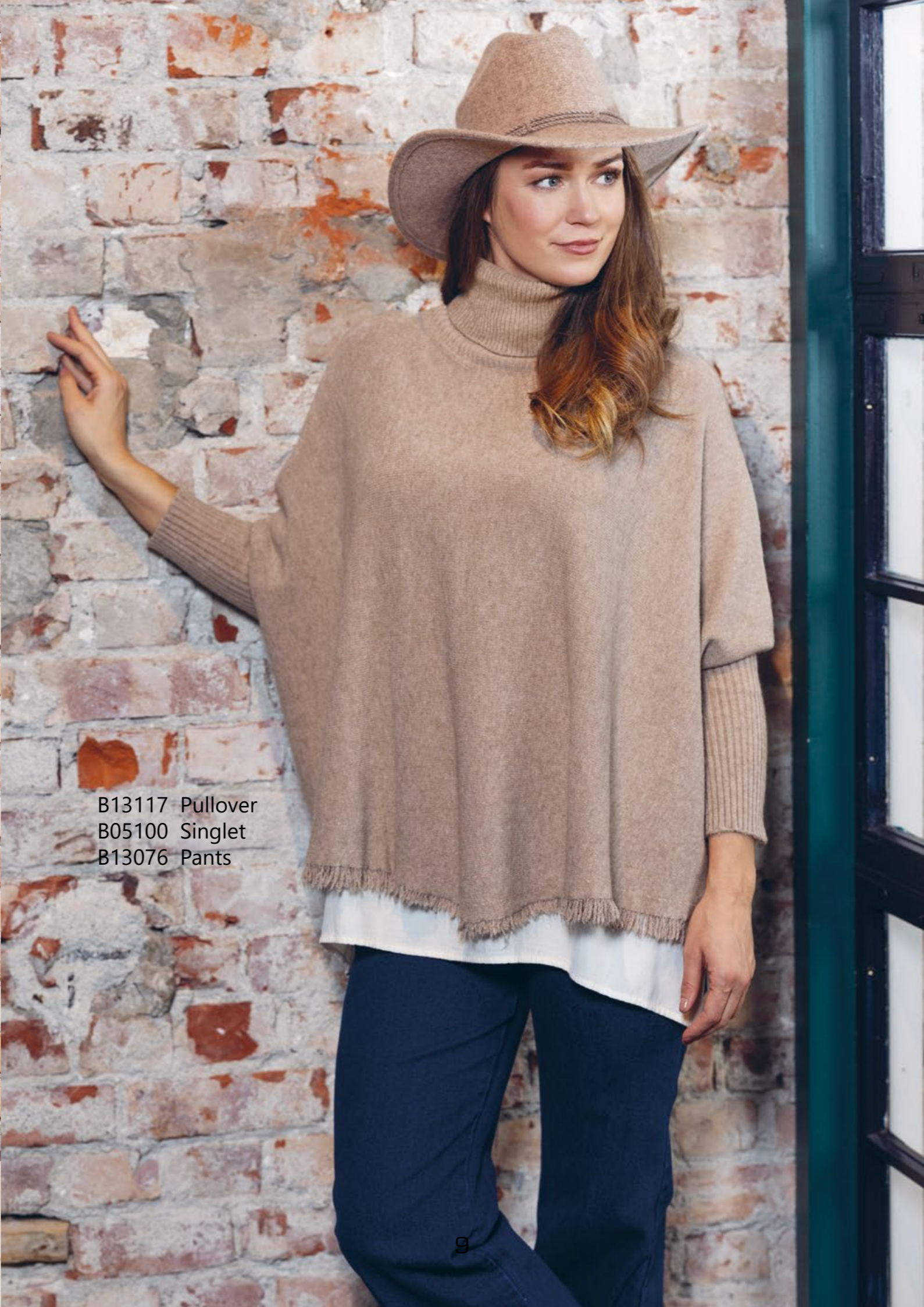
B13117 Pullover B05100 Singlet B13076 Pants