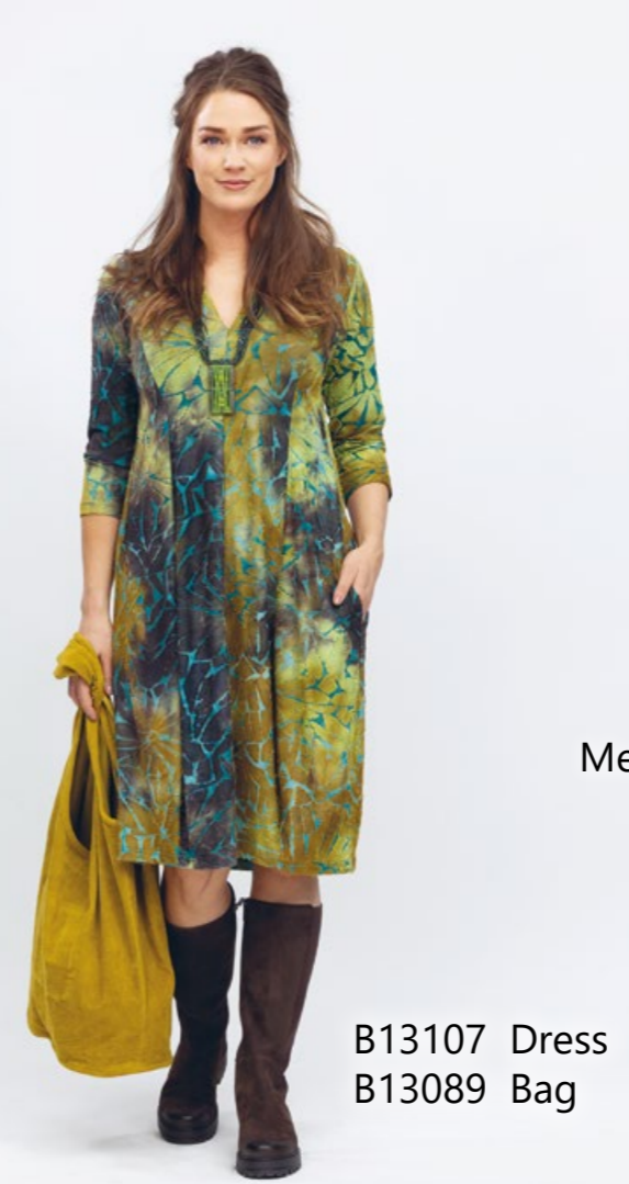
B13107 Dress B13089 Bag