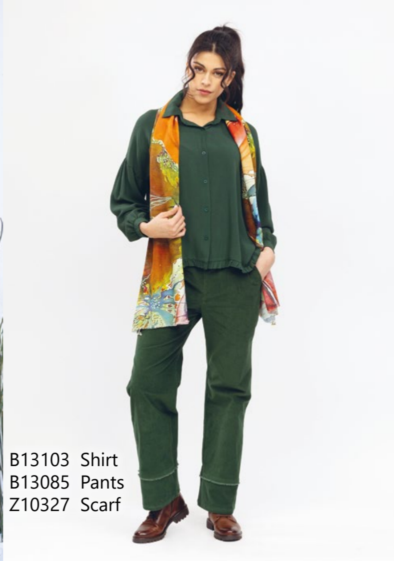
B13103 Shirt B13085 Pants Z10327 Scarf