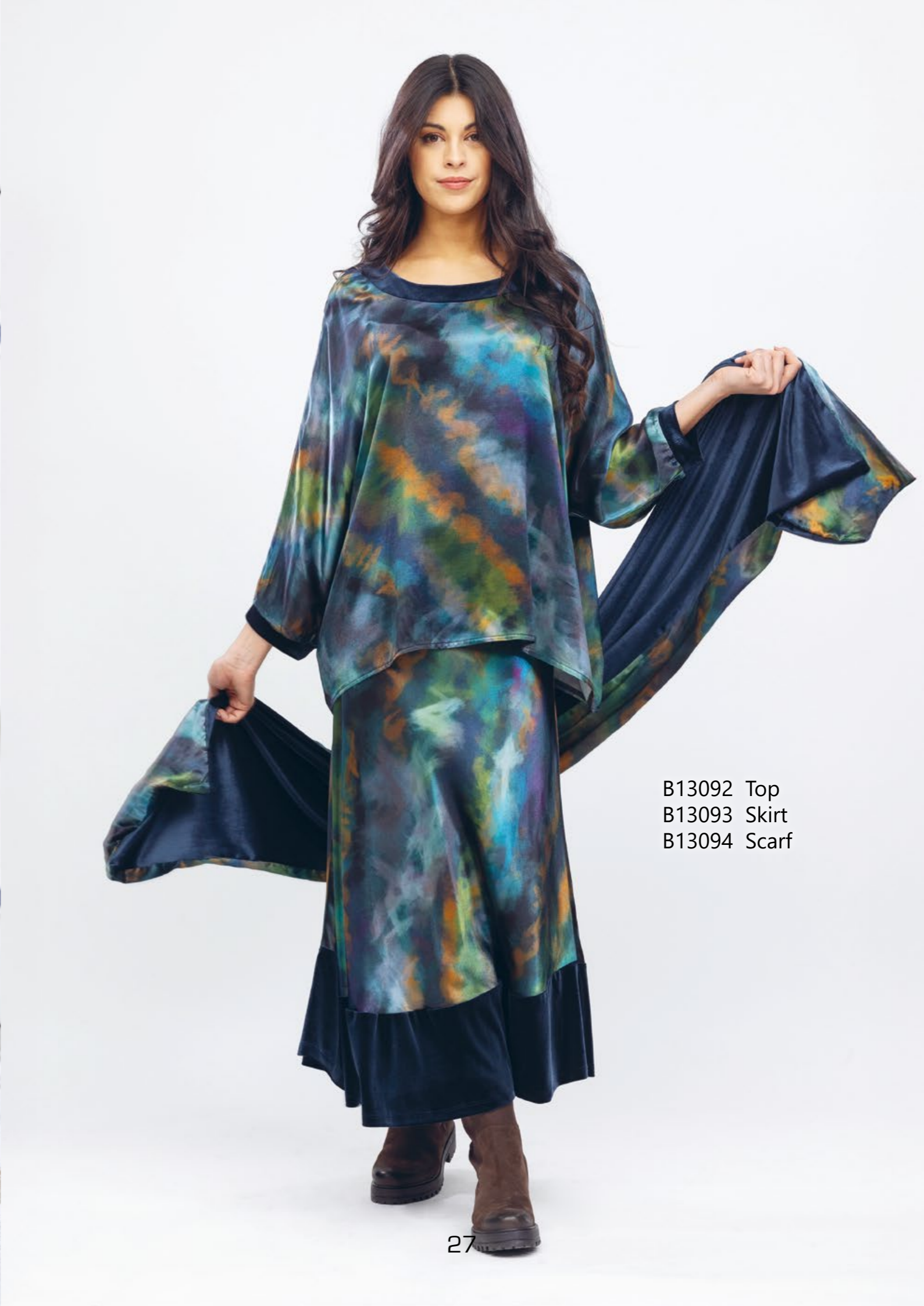
B13092 Top B13093 Skirt B13094 Scarf