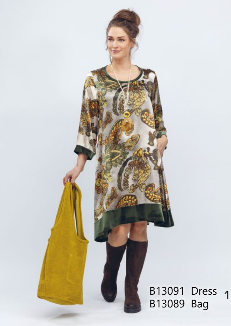
B13091 Dress B13089 Bag