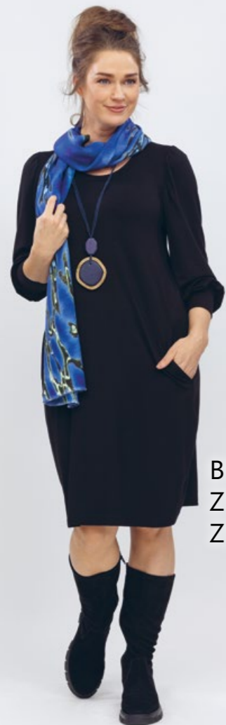
B13123 Dress Z10308 Necklace Z10330 Scarf