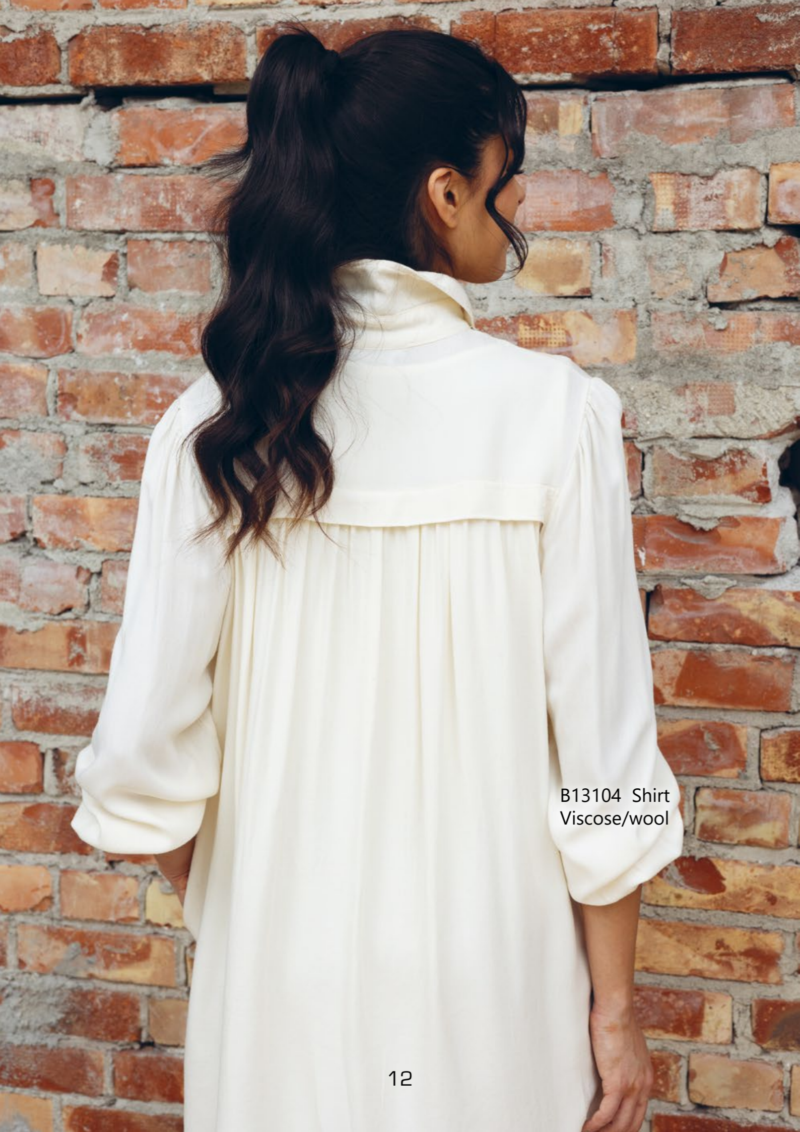
B13104 Shirt Viscose/wool