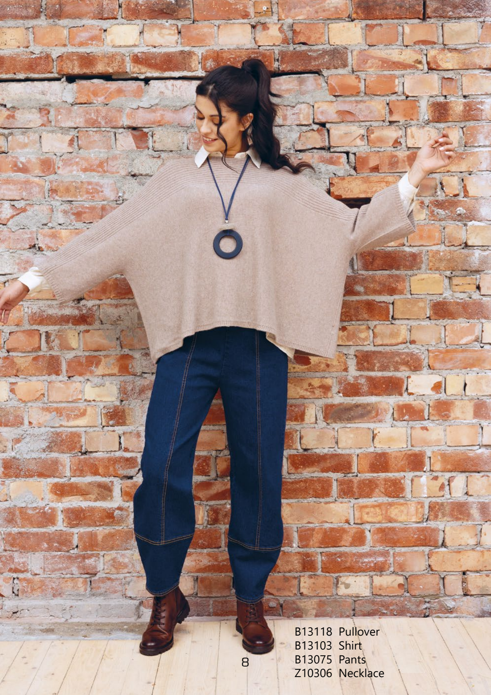
B13118 Pullover B13103 Shirt B13075 Pants Z10306 Necklace