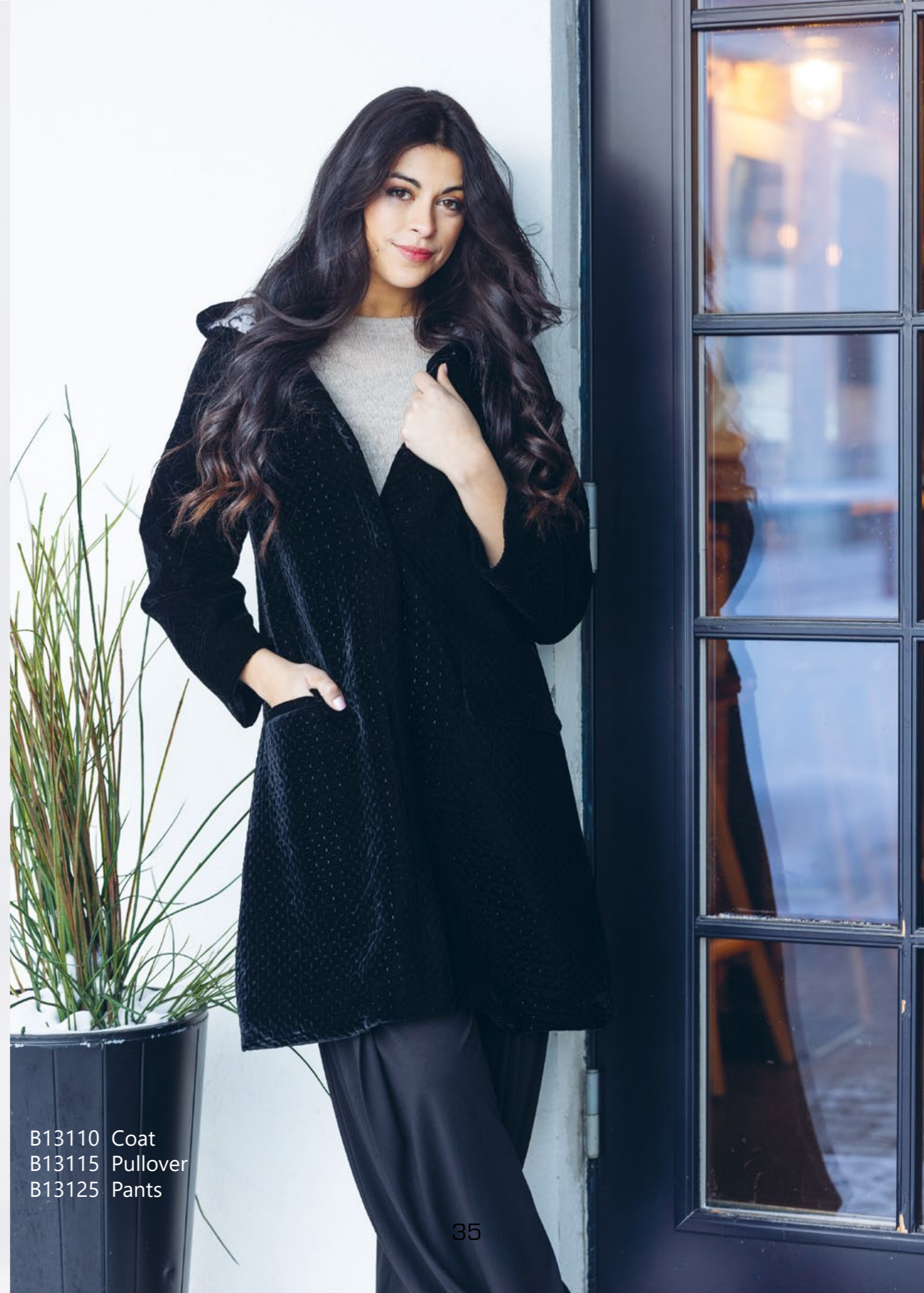
B13110 Coat B13115 Pullover B13125 Pants