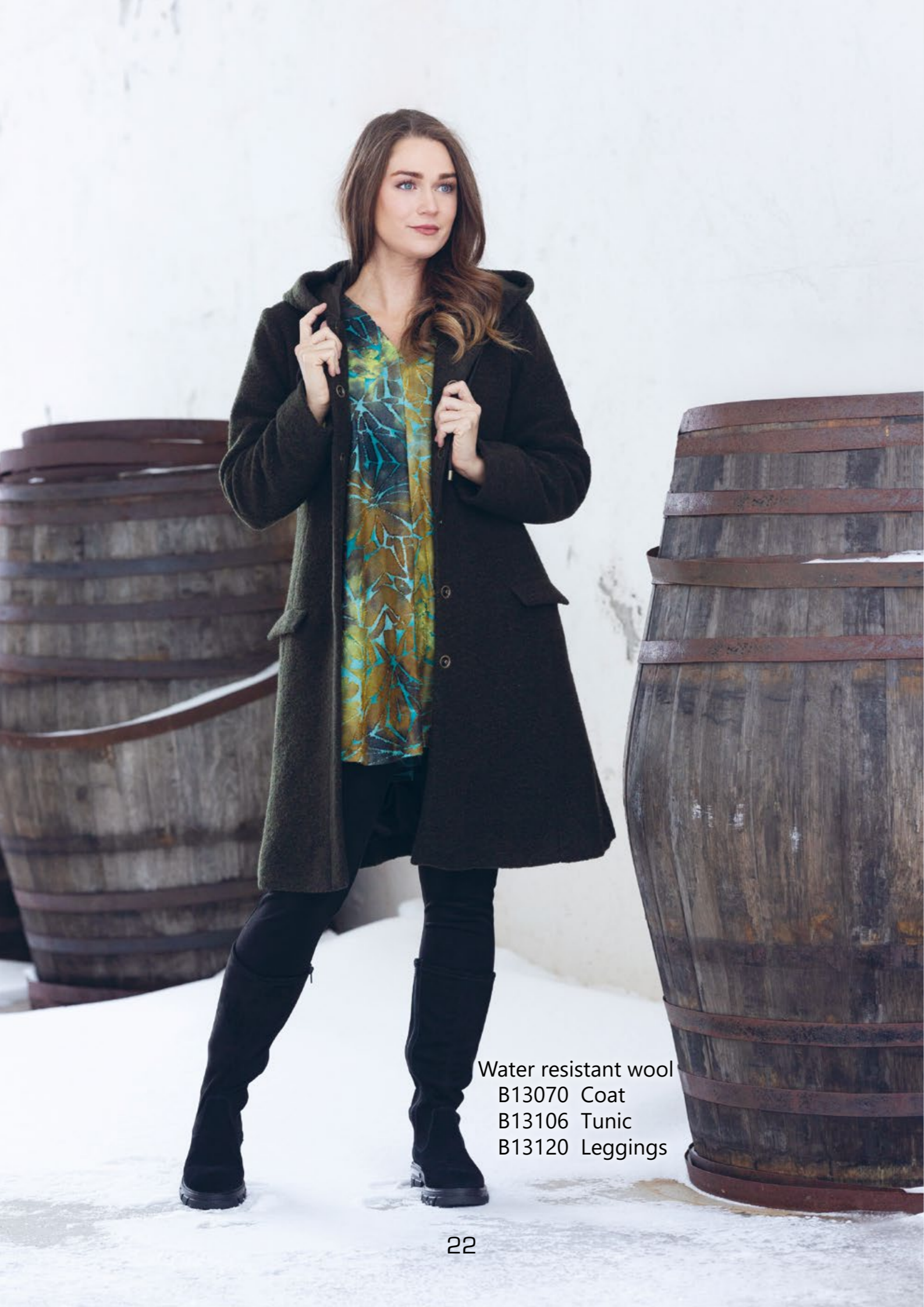
Water resistant wool B13070 Coat B13106 Tunic B13120 Leggings