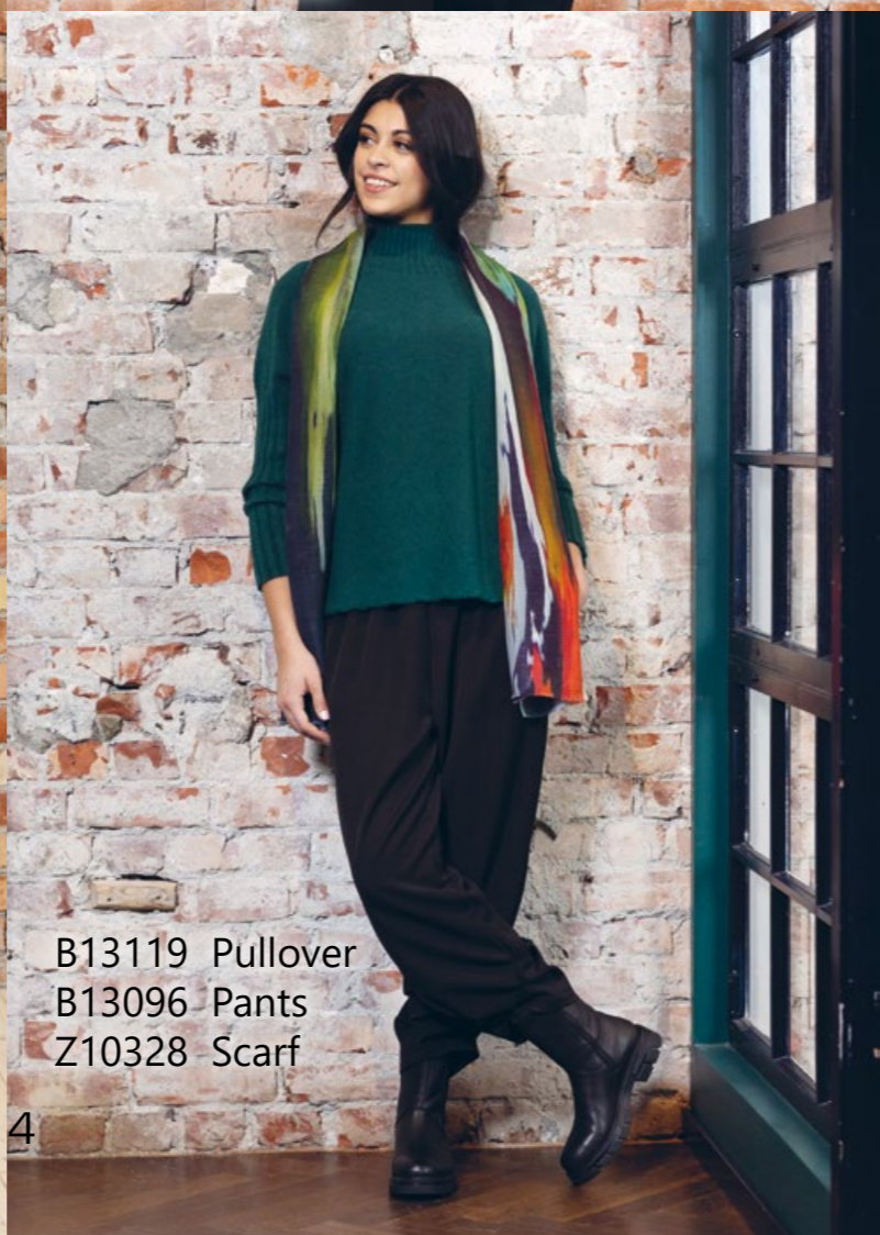
B13119 Pullover B13096 Pants Z10328 Scarf