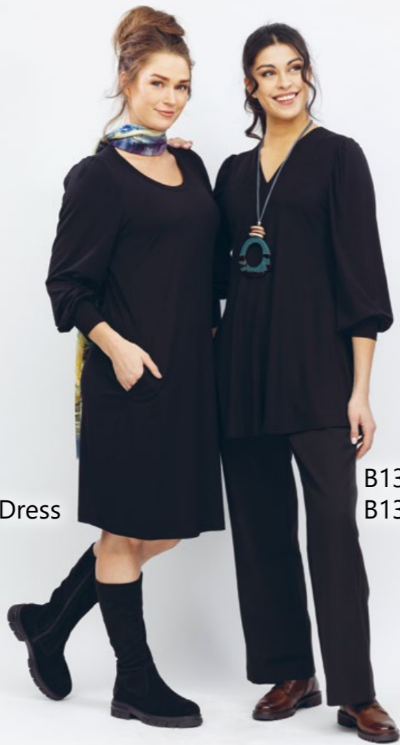
B13124 Tunic B13097 Pants