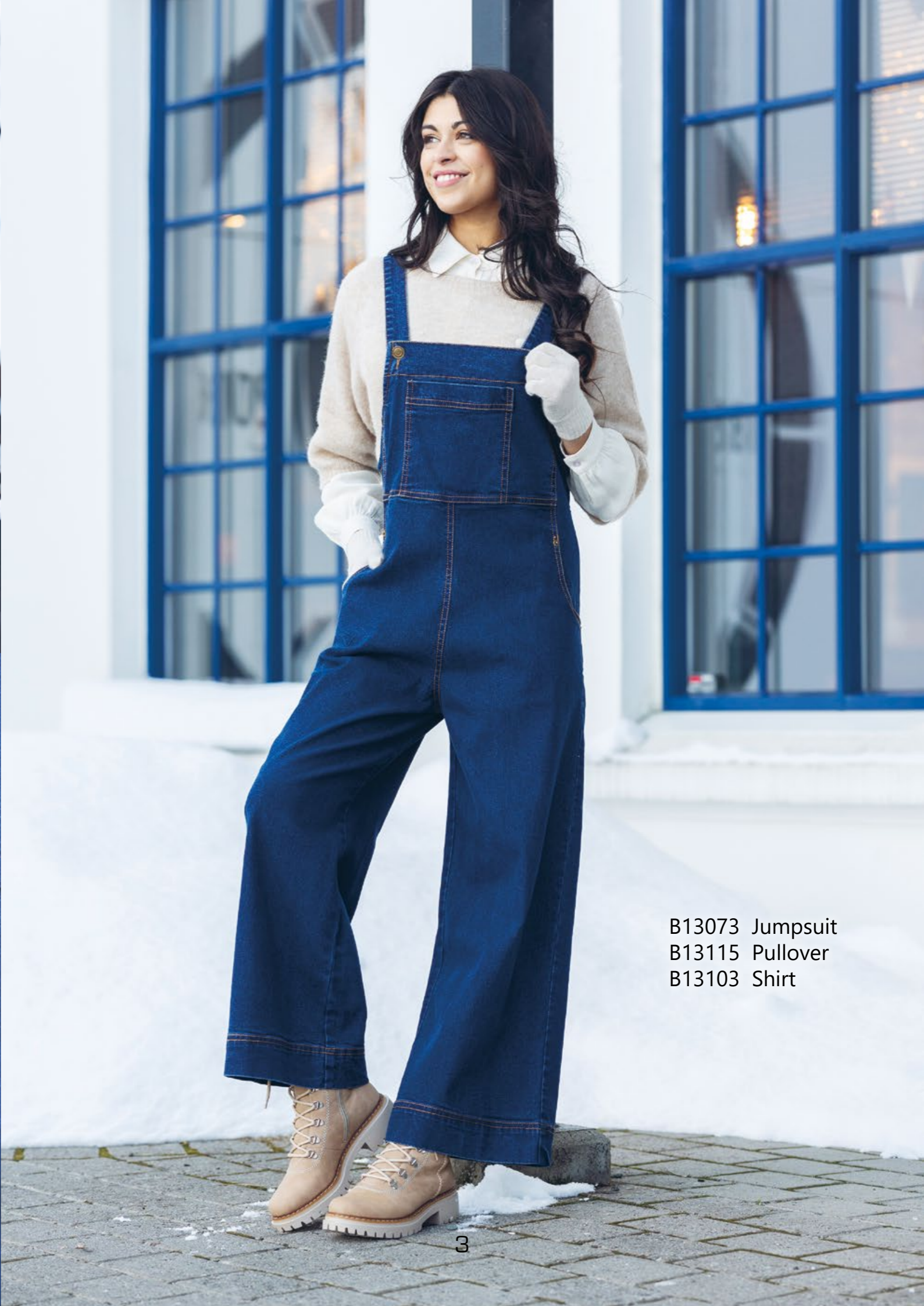
B13073 Jumpsuit B13115 Pullover B13103 Shirt