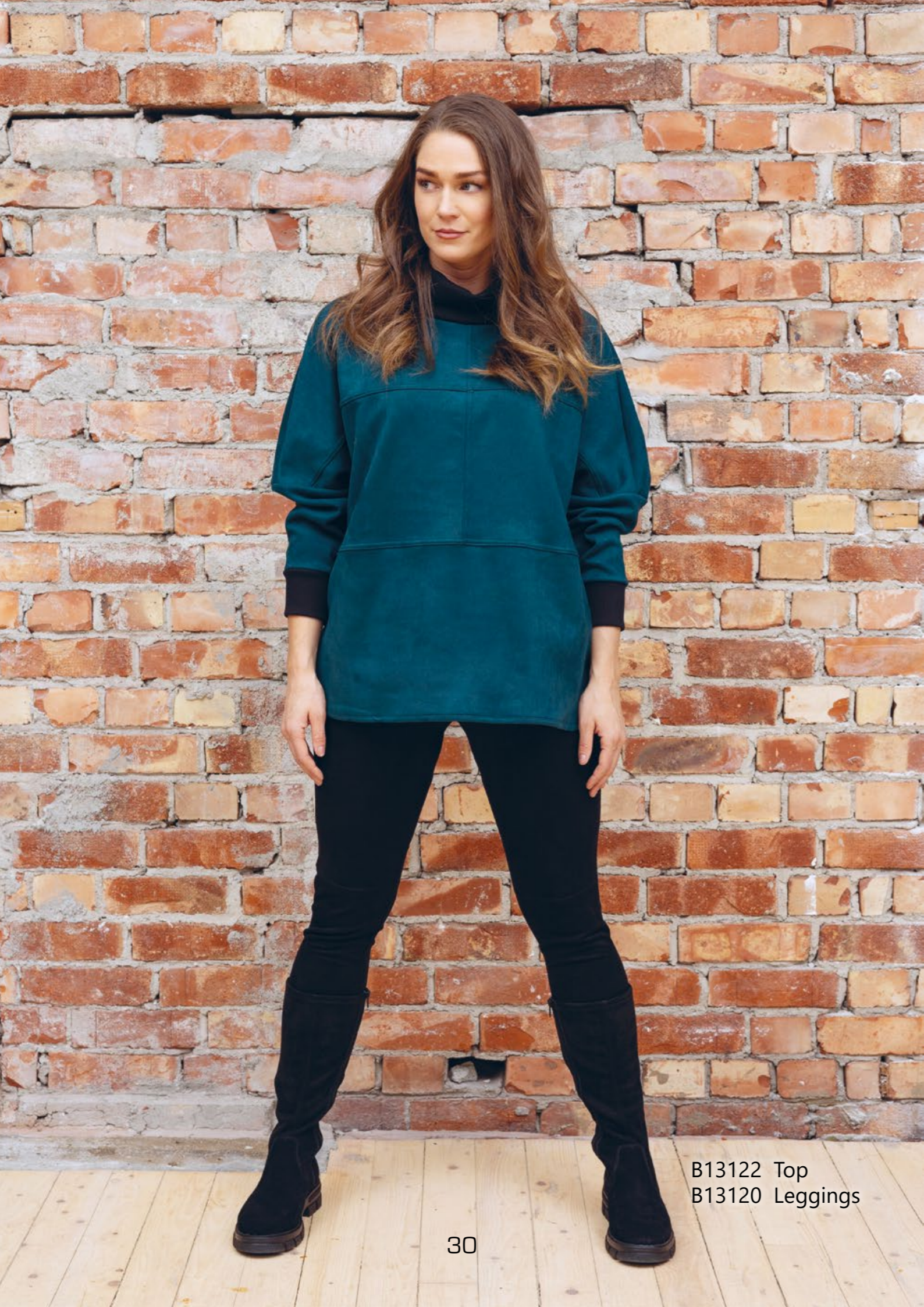
B13122 Top B13120 Leggings