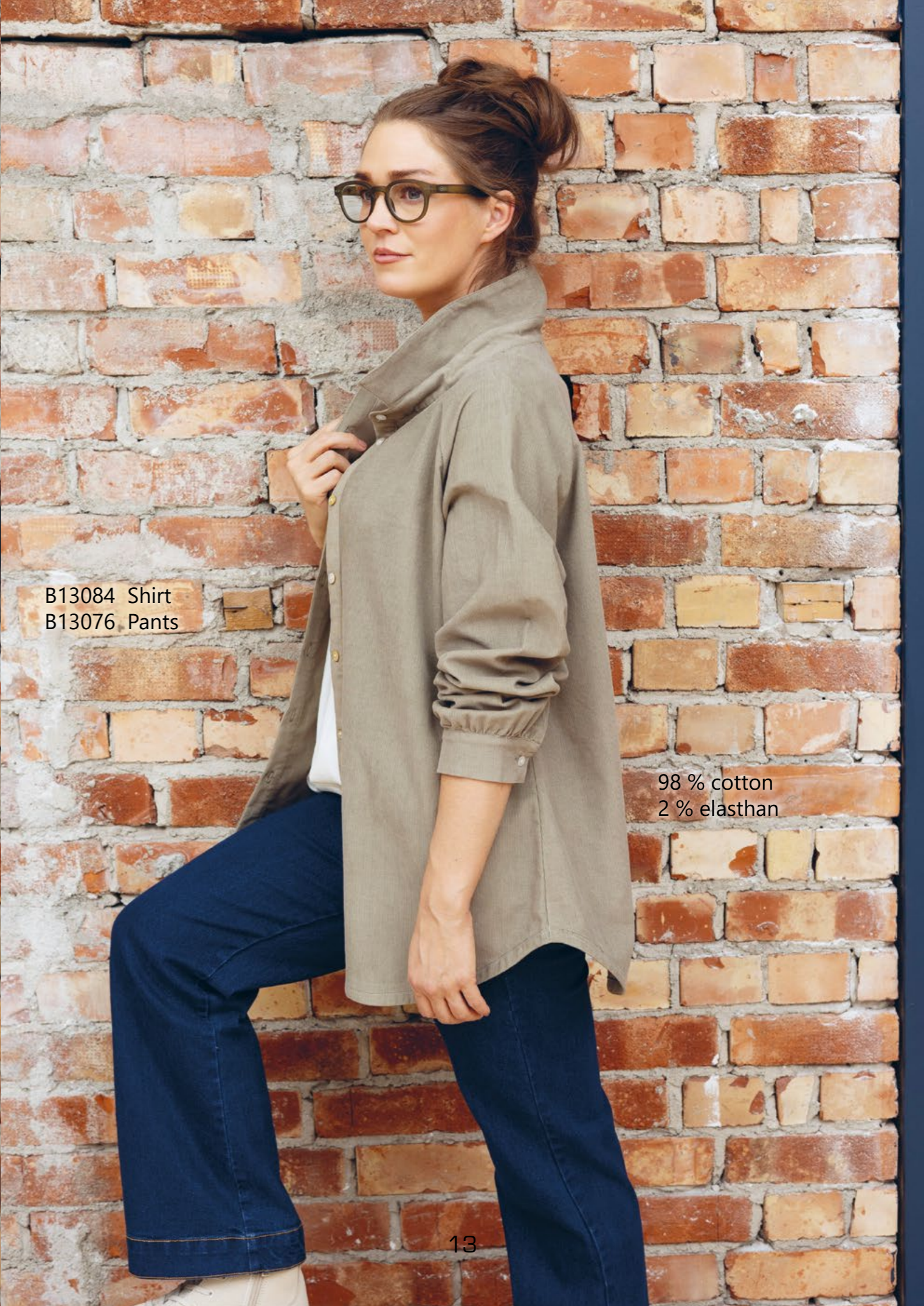
B13084 Shirt B13076 Pants