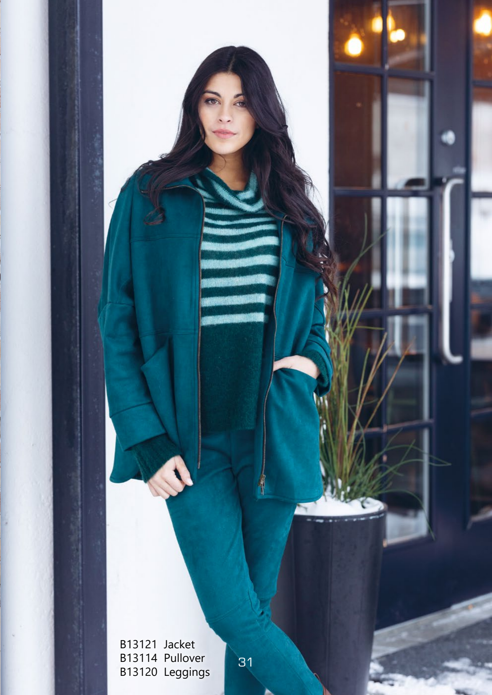
B13121 Jacket B13114 Pullover B13120 Leggings