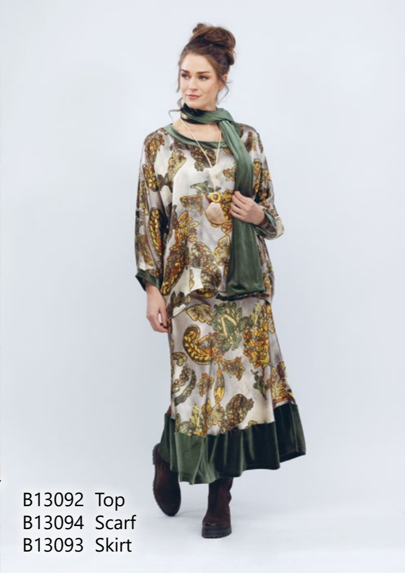
B13092 Top B13094 Scarf B13093 Skirt