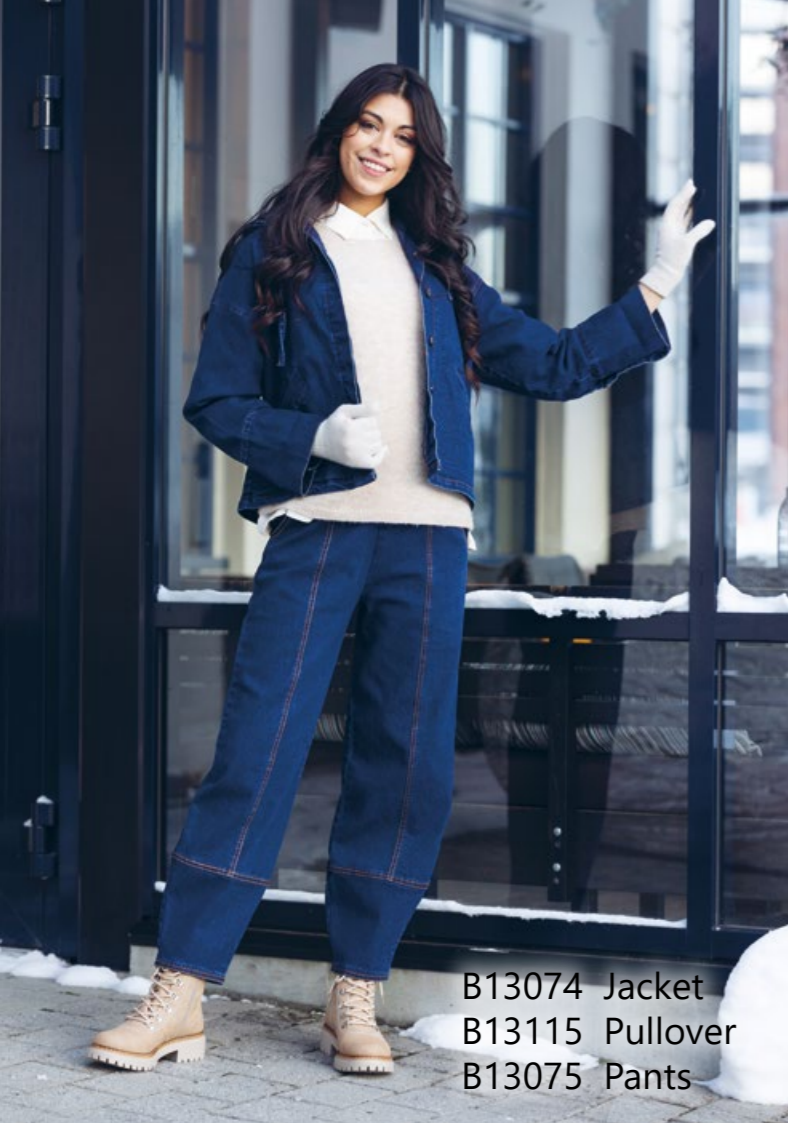
B13074 Jacket B13115 Pullover B13075 Pants