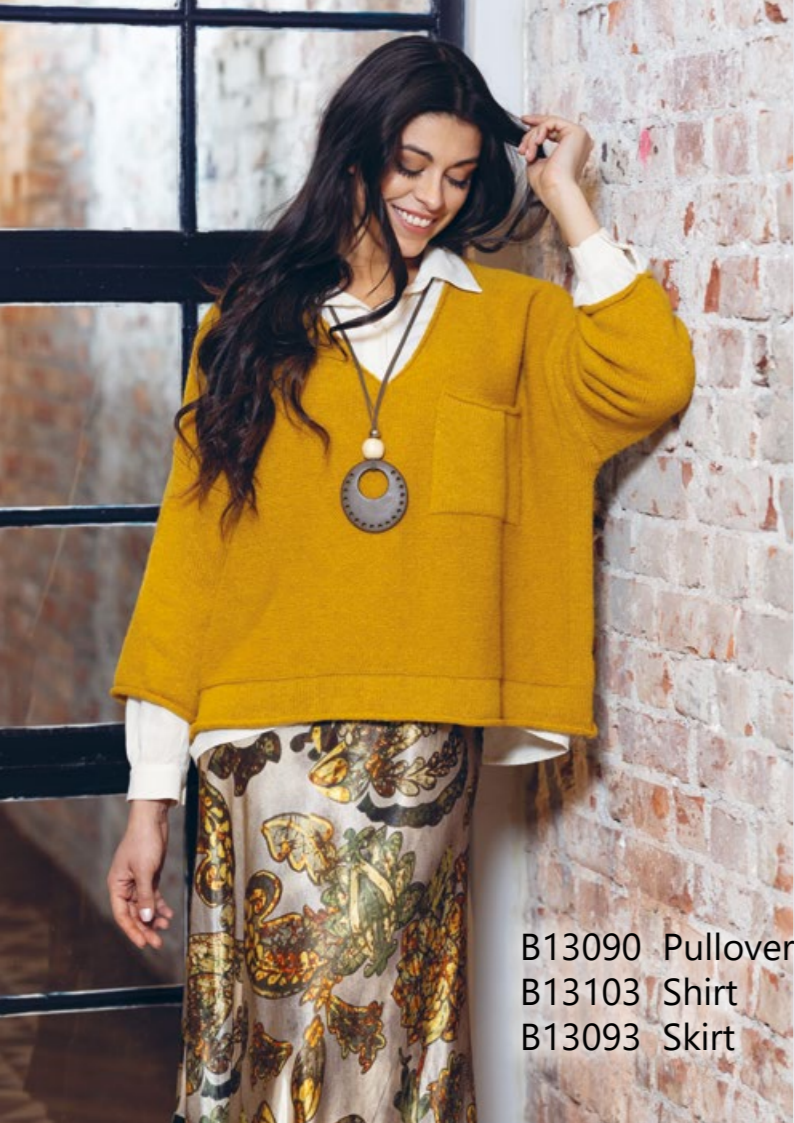
B13090 Pullover B13103 Shirt B13093 Skirt