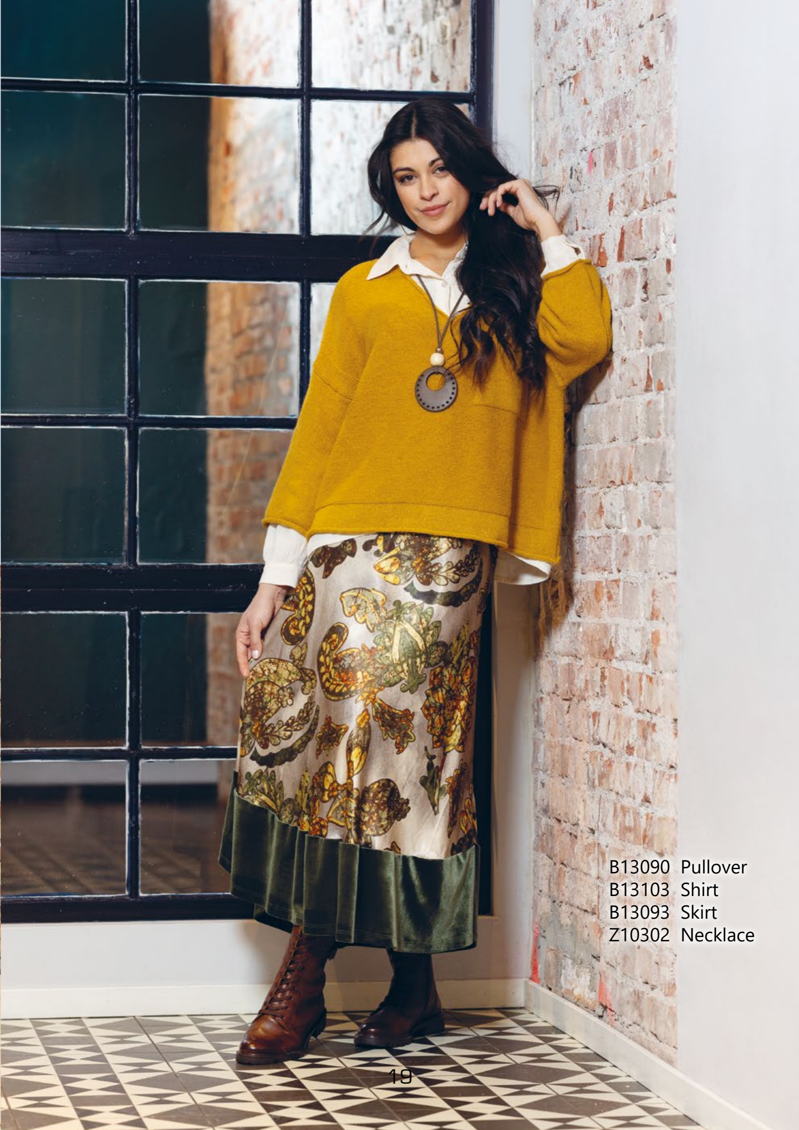
B13090 Pullover B13103 Shirt B13093 Skirt Z10302 Necklace