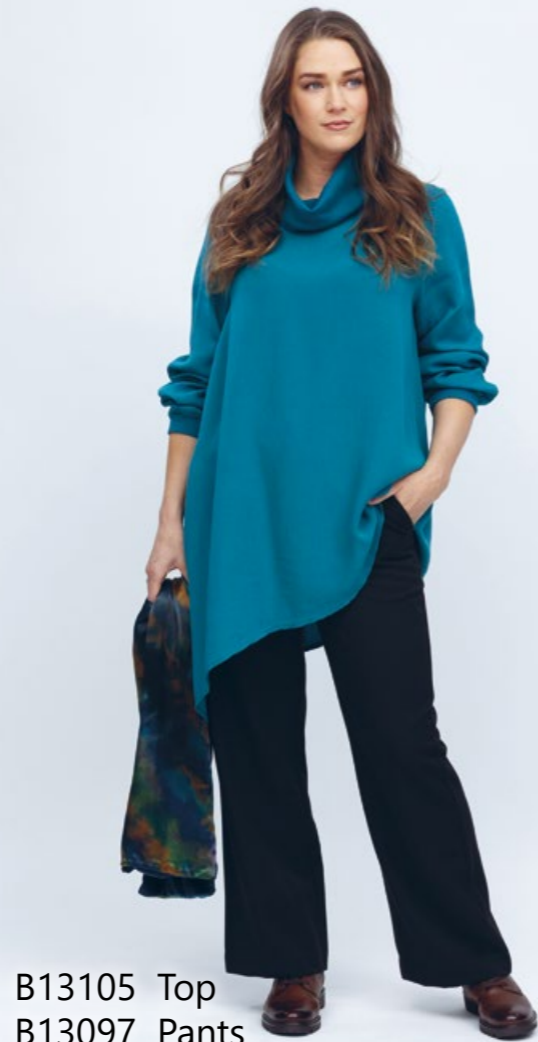
B13105 Top B13097 Pants