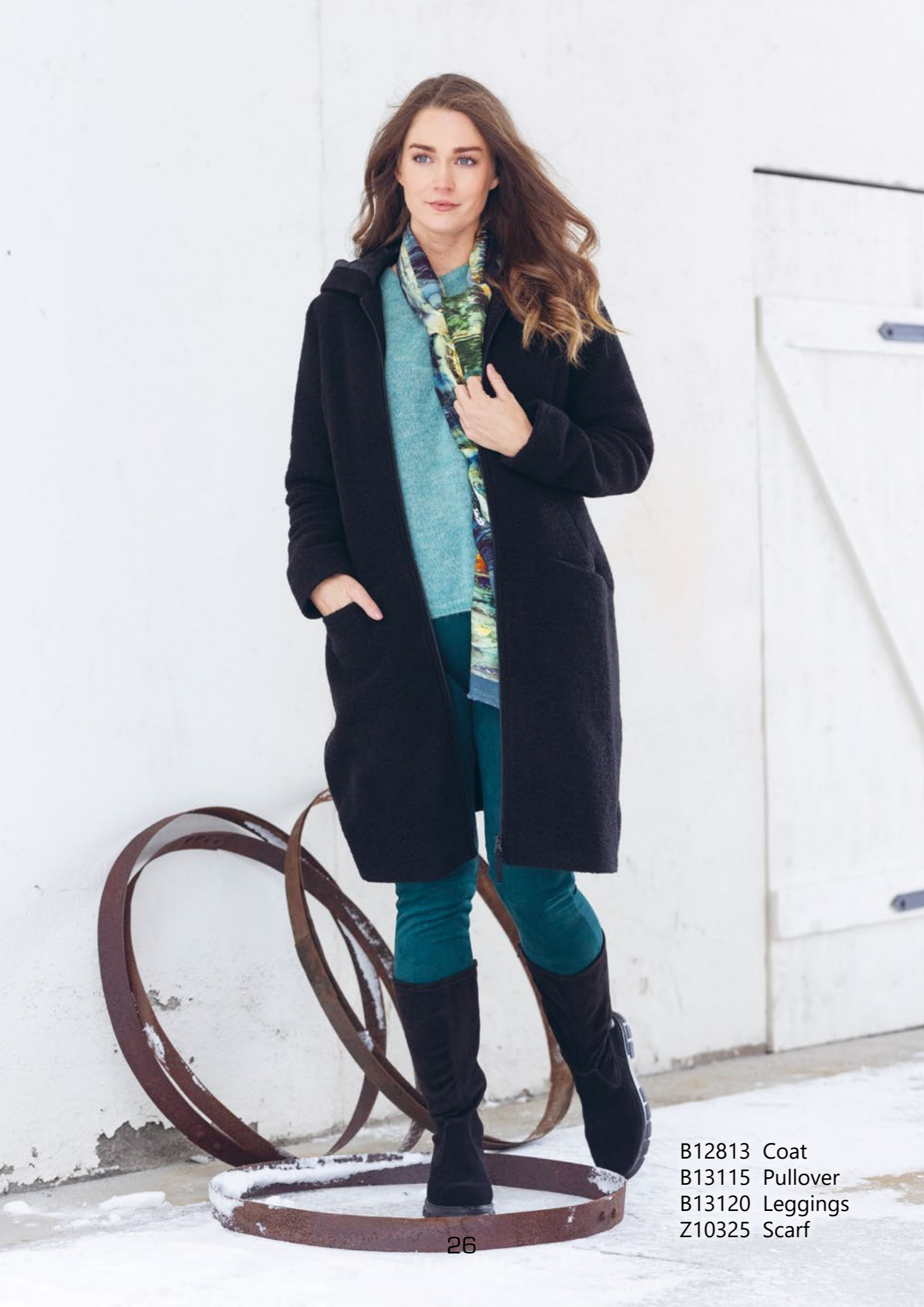
B12813 Coat B13115 Pullover B13120 Leggings Z10325 Scarf