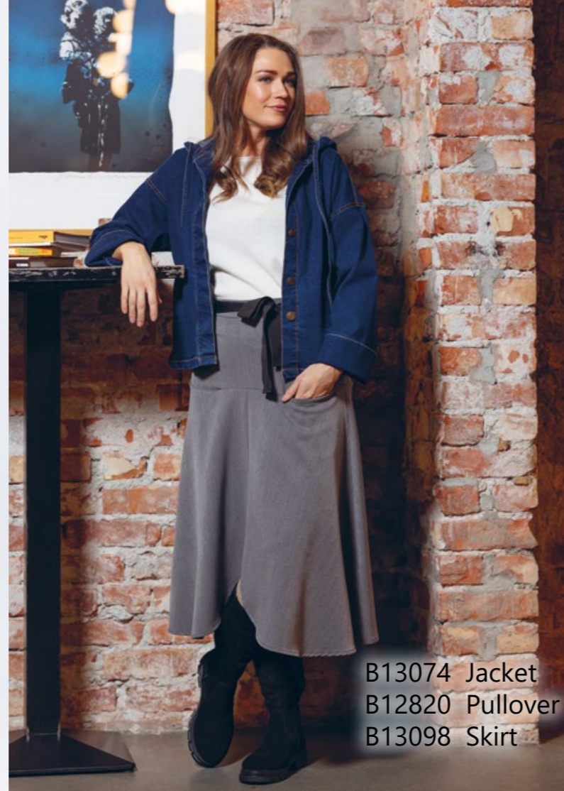
B13074 Jacket B12820 Pullover B13098 Skirt